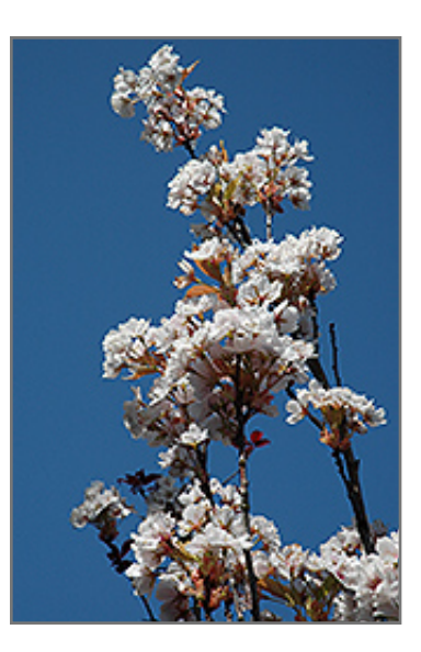
Amanogawa Flowering Cherry flowers

Amanogawa Flowering Cherry is recommended for the following landscape applications;