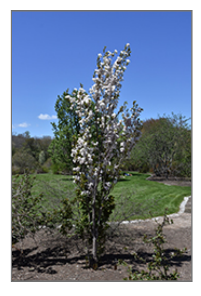
Amanogawa Flowering Cherry in bloom