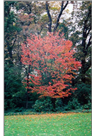
Spire Flowering Cherry in fall