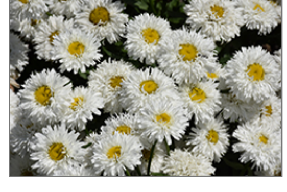
Laspider Shasta Daisy flowers

An outstanding shasta daisy producing stunning, frilly white double blooms with golden centers; a beautiful addition to the garden when massed; hardy and blooms througout the summer