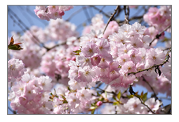
Accolade Flowering Cherry flowers

Accolade Flowering Cherry is a deciduous tree with a more or less rounded form. Its average texture blends into the landscape, but can be balanced by one or two finer or coarser trees or shrubs for an effective composition.