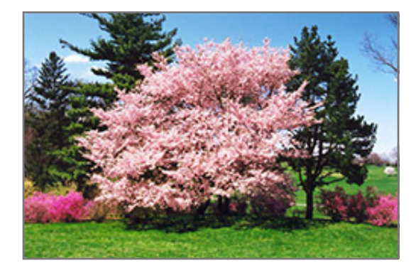
Accolade Flowering Cherry in bloom