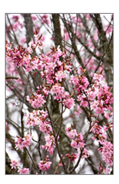
Columnar Sargent Cherry flowers