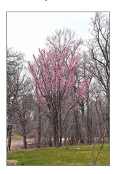
Columnar Sargent Cherry in bloom