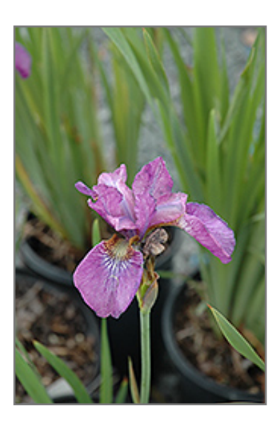
Pink Haze Siberian Iris flowers