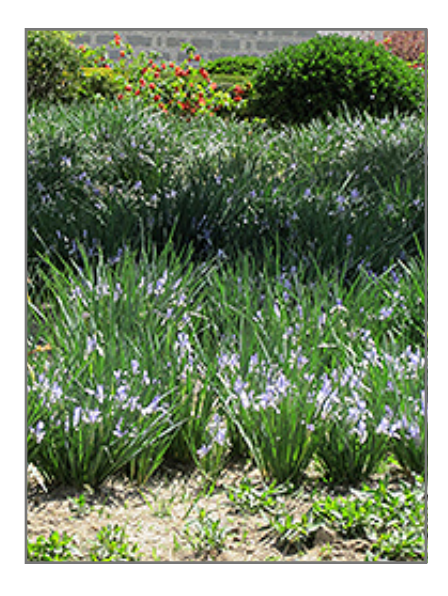
Pallas Chinese Iris in bloom