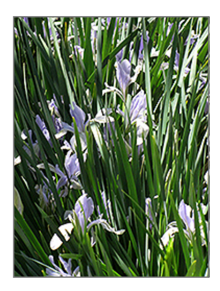
Pallas Chinese Iris in bloom