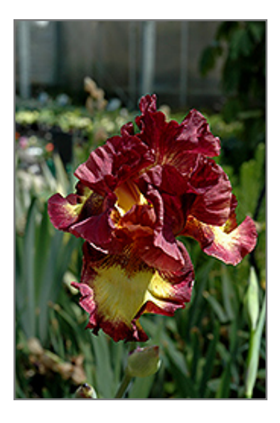
Drama Queen Iris flowers

This tall, interesting iris with its plum purple blooms with butter yellow streaks and golden beard, is a captivating addition to the perennial border; also excellent massed in groupings in the garden; will quickly form dense colonies