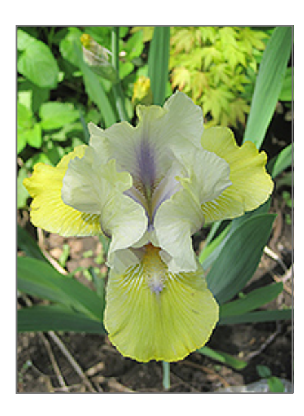
Double Your Fun Iris flowers

This beautiful variety of intermediate height produces large white and yellow blooms with dashes of violet; a perfect sunny border planting, and impressive when massed in the garden; watch for iris borer