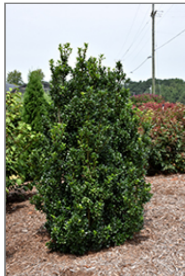
Castle Wall Meserve Holly

Castle Wall Meserve Holly is recommended for the following landscape applications;