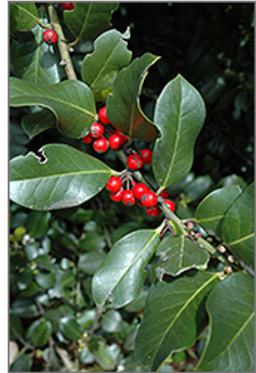
Hendersonii Holly fruit