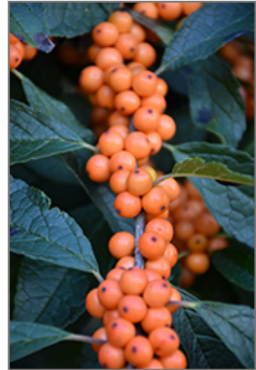
Winter Gold Winterberry fruit