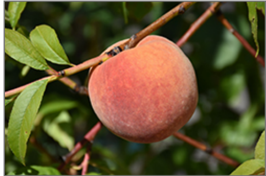
Redhaven Peach fruit