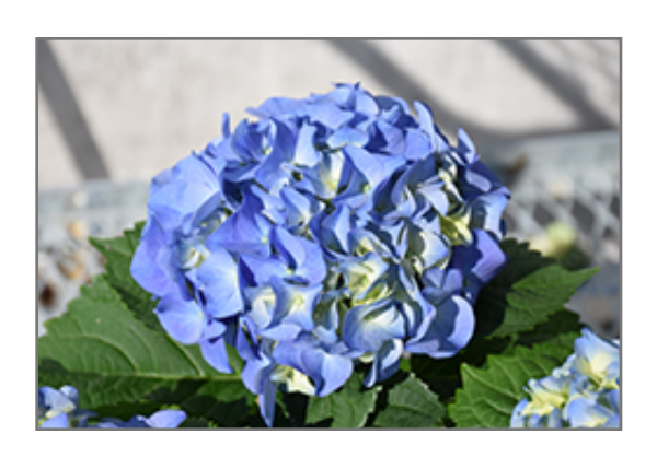
Bela Hydrangea flowers

Bela Hydrangea is recommended for the following landscape applications;