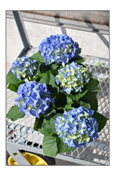
Bela Hydrangea in bloom