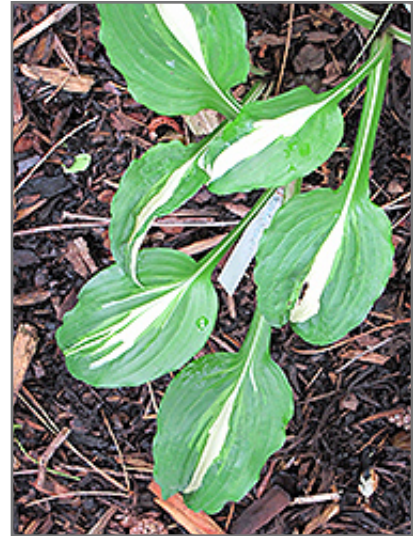
Medium Sized Variegated Hosta foliage