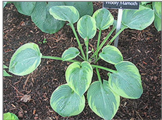
Woolly Mammoth Hosta

Woolly Mammoth Hosta is recommended for the following landscape applications;