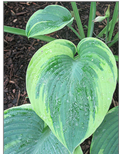
Woolly Mammoth Hosta foliage