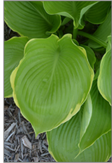
Winter Snow Hosta foliage