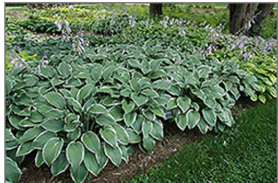
Winter Snow Hosta in bloom