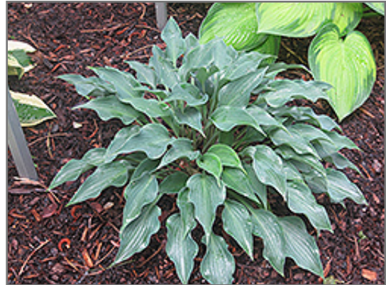
Rhythm And Blues Hosta