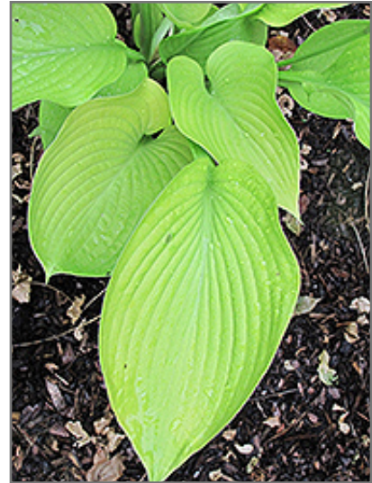
Lime Piecrust Hosta foliage