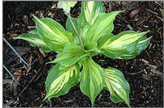
Lakeside Paisley Print Hosta