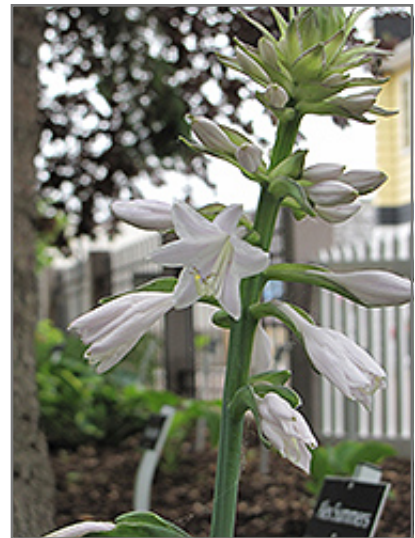
Lakeside Paisley Print Hosta flowers