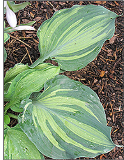
Lakeside Paisley Print Hosta foliage

Lakeside Paisley Print Hosta is a dense herbaceous perennial with tall flower stalks held atop a low mound of foliage. Its medium texture blends into the garden, but can always be balanced by a couple of finer or coarser plants for an effective composition.