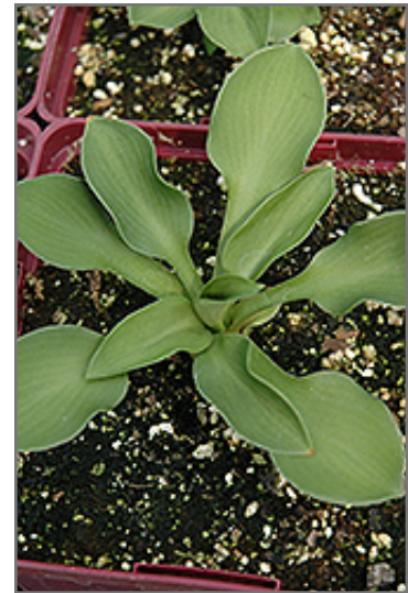
Green Mouse Ears Hosta foliage