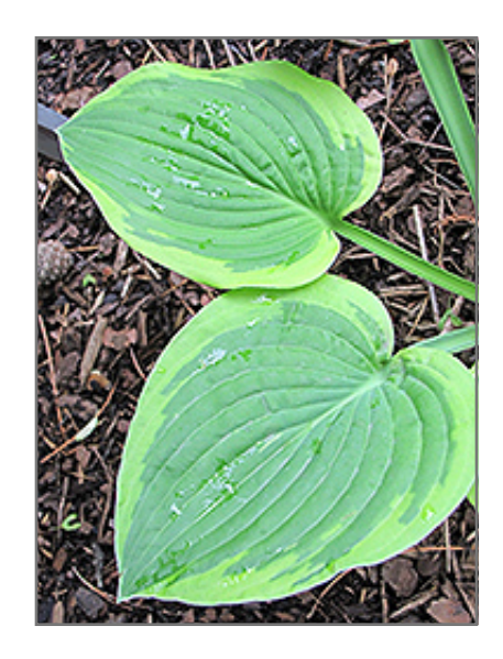
Grand Master Hosta foliage