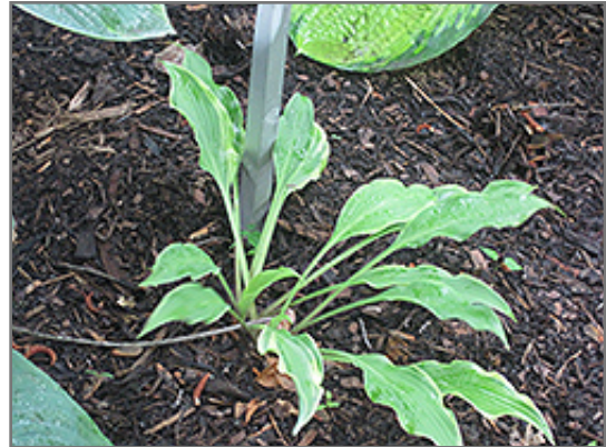
Glory Hallelujah Hosta