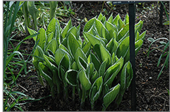
Crowned Imperial Hosta