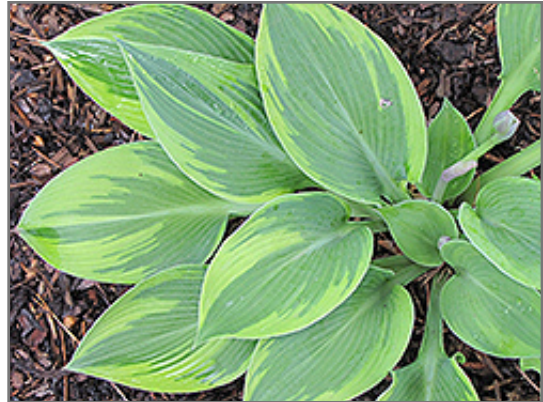
Bolt Out Of The Blue Hosta foliage

Bolt Out Of The Blue Hosta is recommended for the following landscape applications;