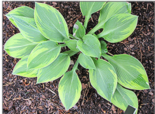
Bolt Out Of The Blue Hosta