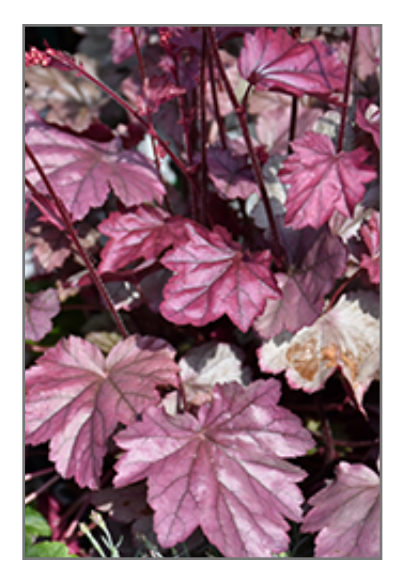
Stainless Steel Coral Bells foliage