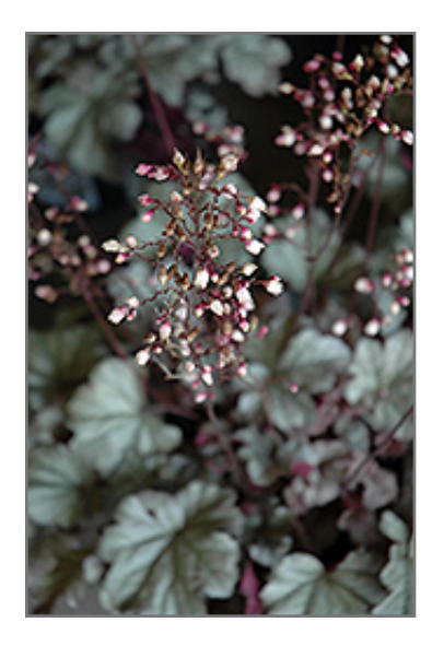
Stainless Steel Coral Bells flowers