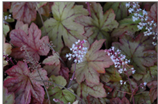
Redstone Falls Foamy Bells flowers