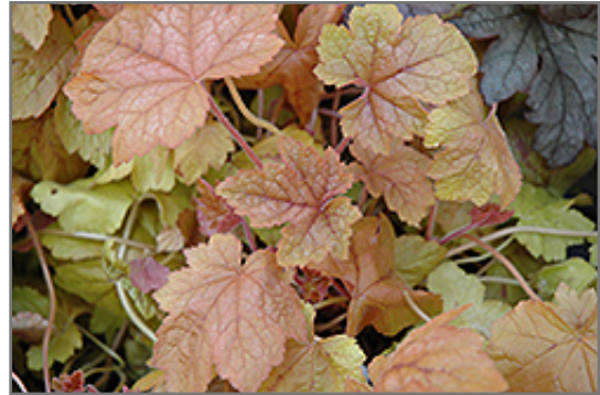
Redstone Falls Foamy Bells foliage

Redstone Falls Foamy Bells is recommended for the following landscape applications;