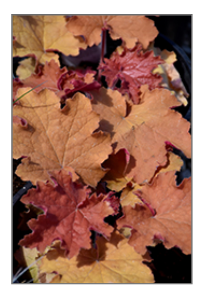
Kassandra Coral Bells foliage

Dainty spikes of ivory white bells rise from a mound of caramel-orange foliage that matures to maroon and reddish-pink by summer; amazing contrast to other plants, great versatility; keep soil moist in the heat of summer