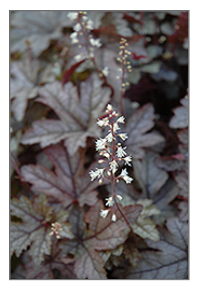
Gunsmoke Coral Bells flowers

Dainty spikes of ivory white bells rise from a dense mound of plum purple foliage that matures to silver-gray with black veins and coppery edges; a striking color addition with great versatility; keep soil moist in the heat of summer