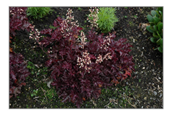
Blackberry Crisp Coral Bells in bloom