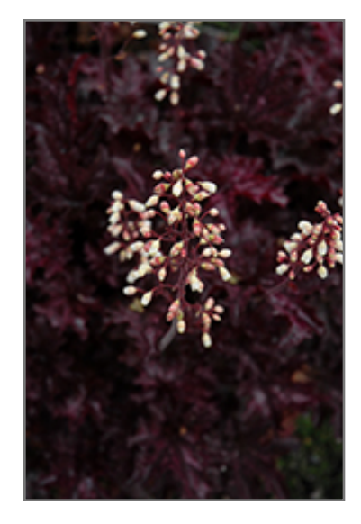
Blackberry Crisp Coral Bells flowers

This is a relatively low maintenance plant, and should be cut back in late fall in preparation for winter. It is a good choice for attracting hummingbirds to your yard. It has no significant negative characteristics.