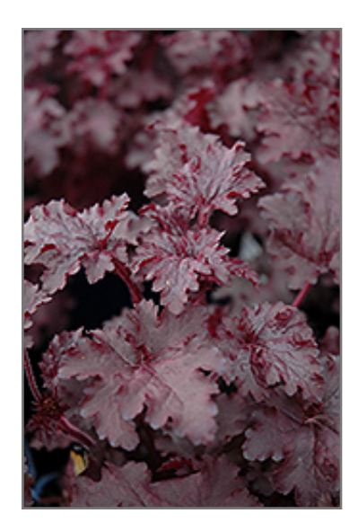
Blackberry Crisp Coral Bells foliage

Blackberry Crisp Coral Bells will grow to be about 18 inches tall at maturity extending to 24 inches tall with the flowers, with a spread of 18 inches. When grown in masses or used as a bedding plant, individual plants should be spaced approximately 15 inches apart. Its foliage tends to remain dense right to the ground, not requiring facer plants in front. It grows at a medium rate, and under ideal conditions can be expected to live for approximately 10 years. As an evegreen perennial, this plant will typically keep its form and foliage year-round.