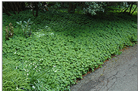
White European Liverleaf