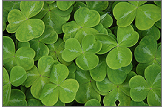
White European Liverleaf foliage