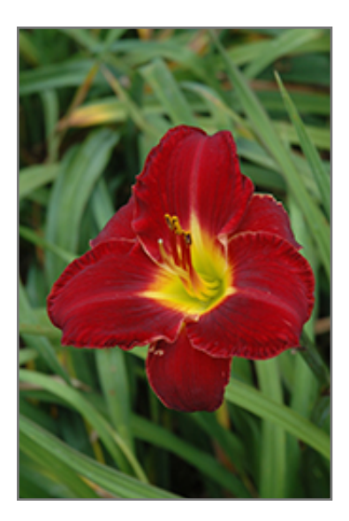
Prairie Wildfire Daylily flowers