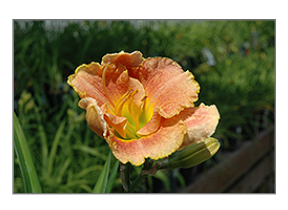
Marmalade Daylily flowers

Orange-salmon ruffled trumpets with a bright yellow throat; provides a graceful addition to the garden; sturdy, strong, easy to care for, great grassy texture and form; a stunning display when massed in the garden