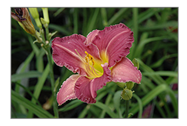
Entertainment Daylily flowers