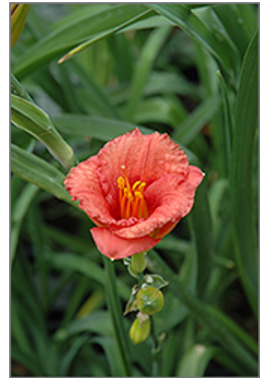
Cosmopolitan Daylily flowers