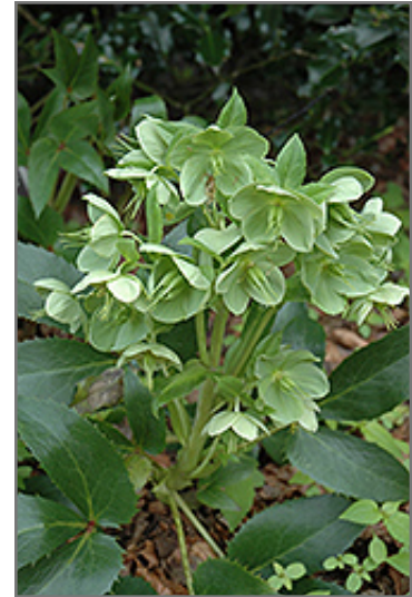
Eric Smith Hellebore flowers