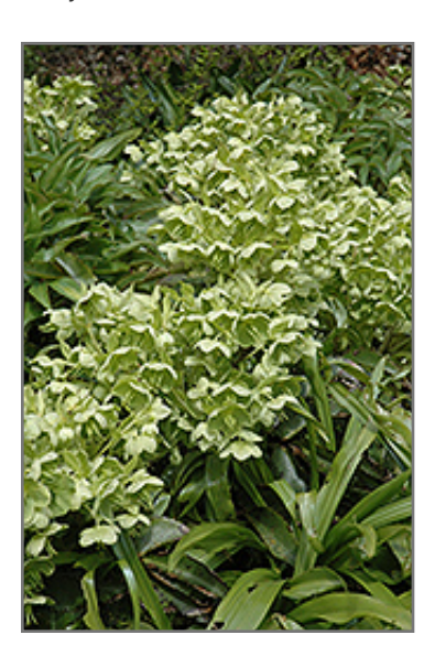
Corsican Hellebore flowers