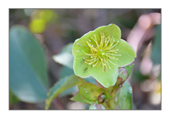
Corsican Hellebore flowers

Corsican Hellebore is recommended for the following landscape applications;