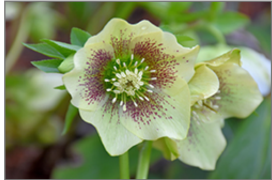
Yellow Lady Hellebore flowers