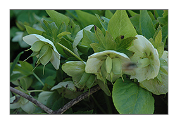
Ushba Hellebore flowers