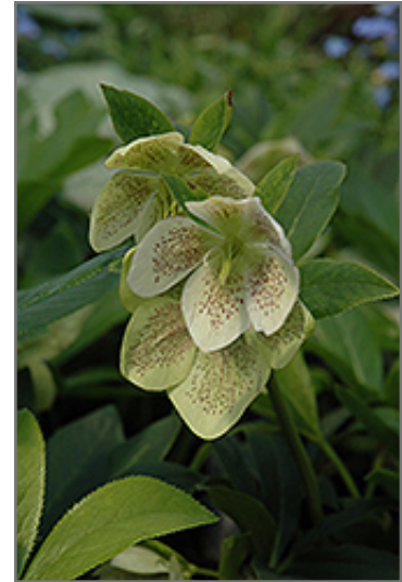
Spring Promise Sandra Hellebore flowers