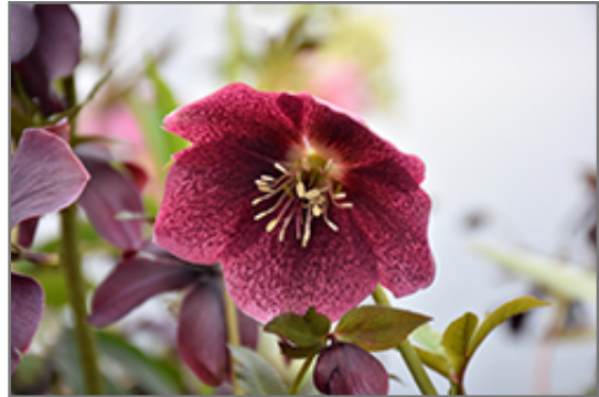
Blue Lady Hellebore flowers

Blue Lady Hellebore is recommended for the following landscape applications;