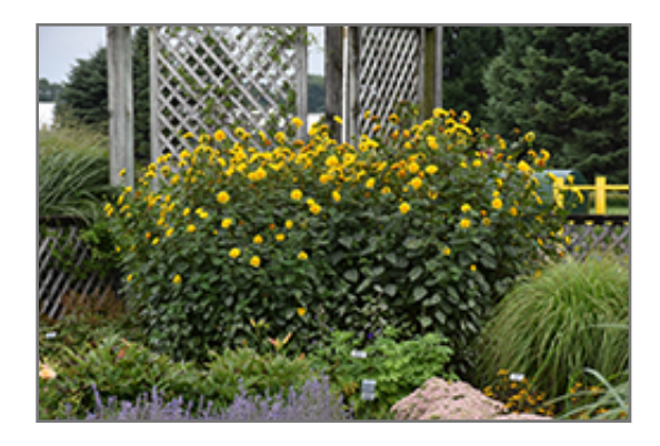
Sunshine Daydream Sunflower in bloom