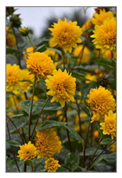
Sunshine Daydream Sunflower flowers

This plant will require occasional maintenance and upkeep, and is best cleaned up in early spring before it resumes active growth for the season. It is a good choice for attracting butterflies to your yard. Gardeners should be aware of the following characteristic(s) that may warrant special consideration;