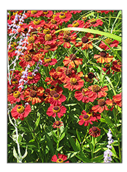
Rubinzwerg Sneezeweed in bloom