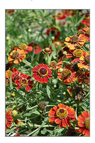
Rubinzwerg Sneezeweed flowers