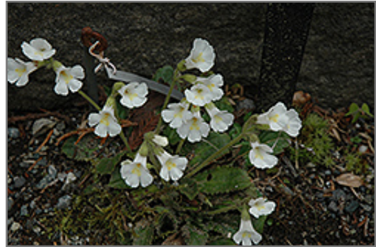
Virginalis Hardy African Violet in bloom

Other Names: White Hardy African Violet, Resurrection Plant