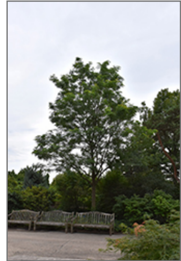
Perfection Honeylocust

Perfection Honeylocust will grow to be about 50 feet tall at maturity, with a spread of 35 feet. It has a high canopy with a typical clearance of 7 feet from the ground, and should not be planted underneath power lines. As it matures, the lower branches of this tree can be strategically removed to create a high enough canopy to support unobstructed human traffic underneath. It grows at a fast rate, and under ideal conditions can be expected to live for 70 years or more.