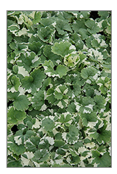
Variegated Ground Ivy foliage

An aggressive, dense creeper of small green and white variegated leaves on trailing stems; small violet-blue flowers in spring; excellent for hanging baskets and lawn replacement; keep clear of beds and borders as it tends to take over