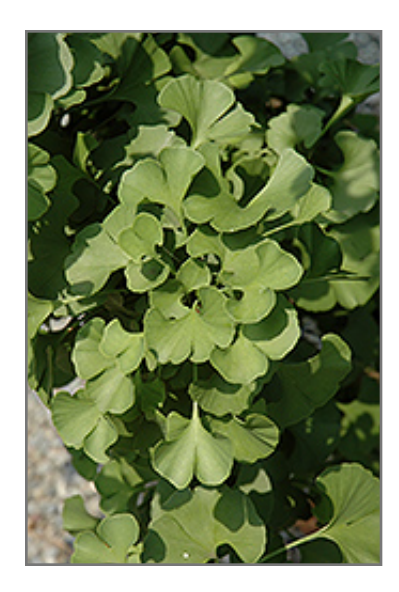
Spring Grove Dwarf Ginkgo foliage