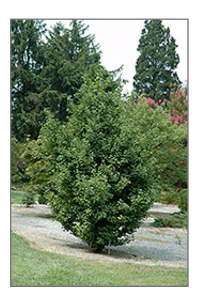
Spring Grove Dwarf Ginkgo