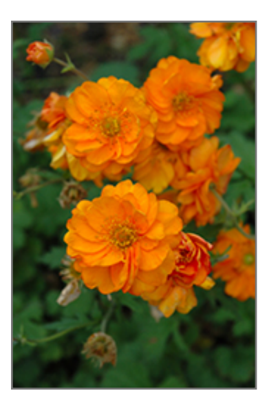
Fire Storm Avens flowers

Fire Storm Avens is recommended for the following landscape applications;