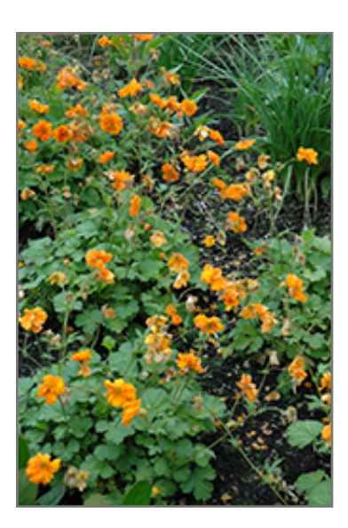
Fire Storm Avens in bloom