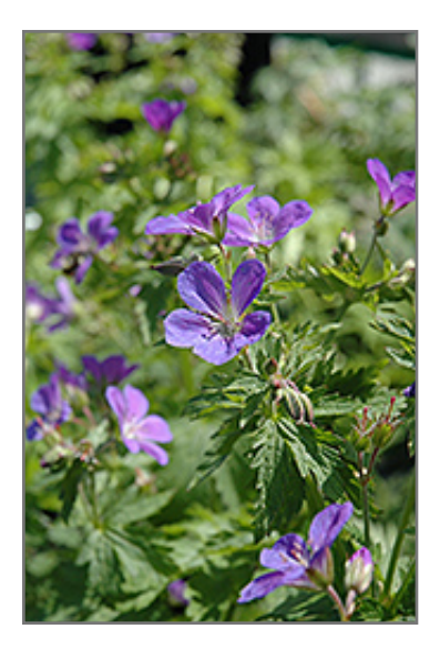
Mayflower Cranesbill flowers

A fine textured mound of violet-blue saucer shaped blooms with white centers and streaks; deadhead spent flowers for reblooming later in the season