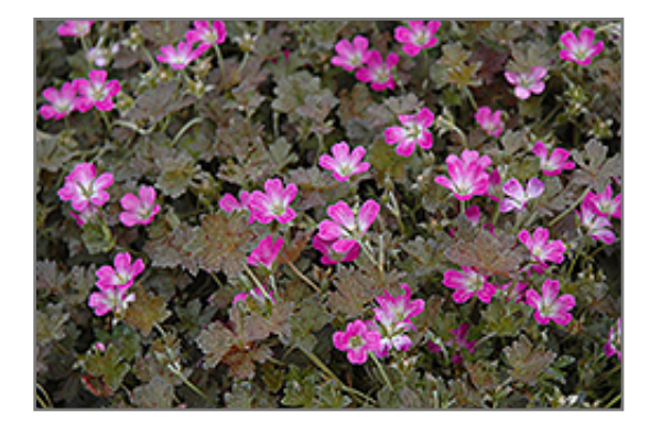
Orkney Cherry Dwarf Cranesbill flowers